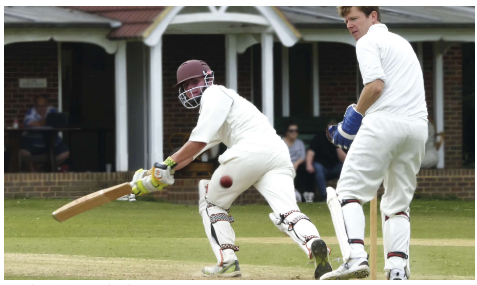
Kemsing suffered their third loss of the season away to Meopham's 2nd XI