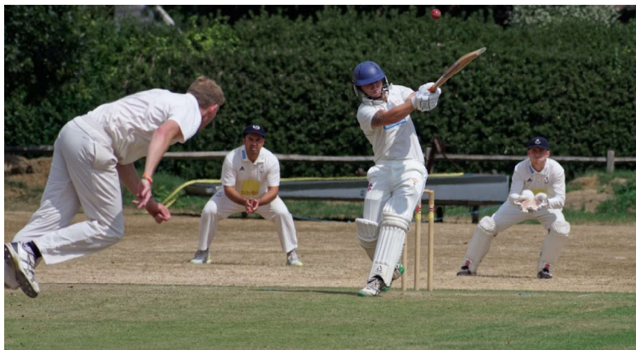
Sevenoaks Vine 2nd did well to bowl out a Lordswood side that hit 366-2 the week before