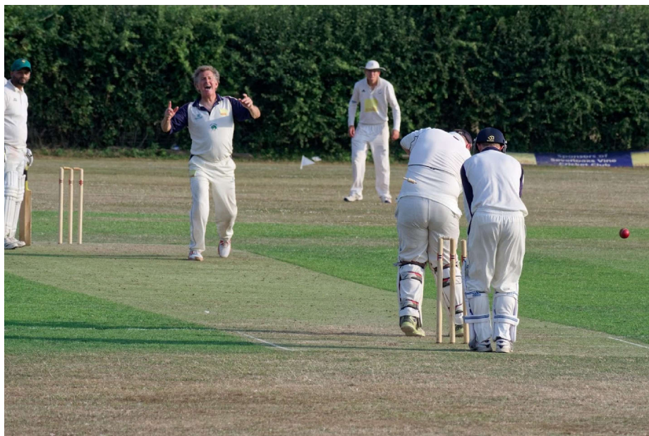
Sevenoaks Vine 3rd XI in action against Lordswood 3rd at Orchard Field in Otford