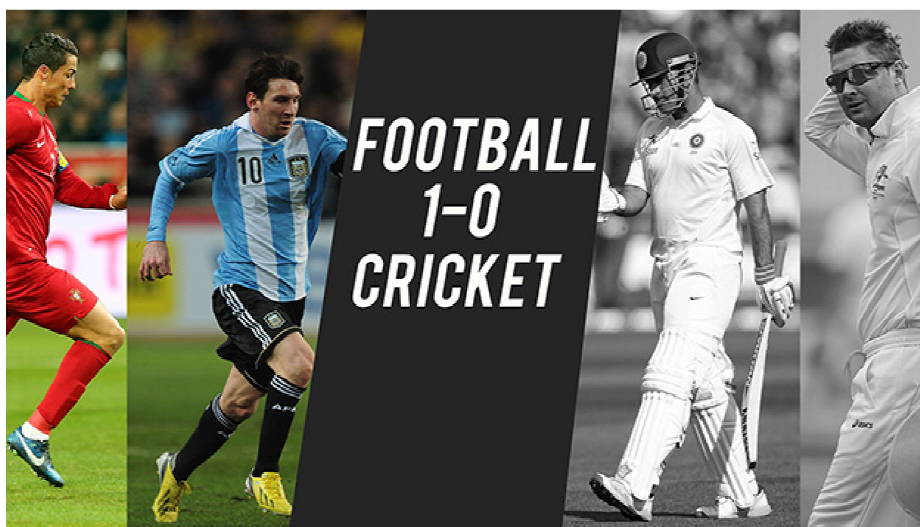
34 cricket matches were conceded across Kent on Saturday as England played Sweden