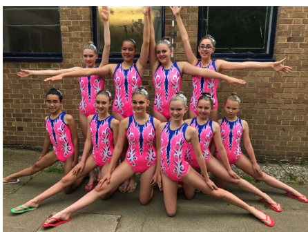
The under-15's Synchronised Swimming team

This was their first competition this season, with each team swimming a