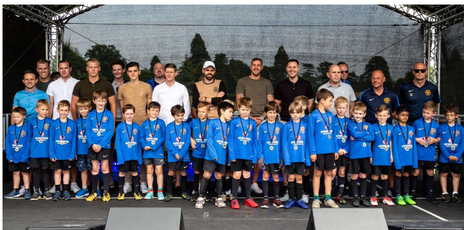
The first team walked the under 7's to the stage at Greatness Park on Saturday afternoon

The club, who can boast being the largest grassroots football club in the South East of England went big with a full sized stage in the 3 hour awards marathon.