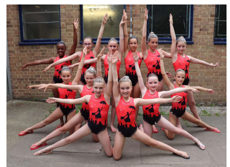
The under-12's Synchronised Swimming team

Both teams are looking forward to their next outings at the Kents in Canterbury on June 24th and their first swim in the National Combo Cup at the London Aquatic Centre on July 7th.