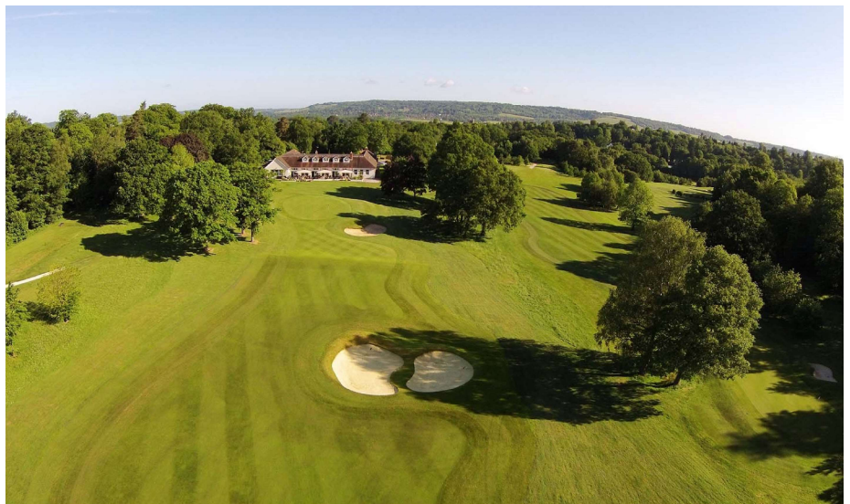
Wildernesse Golf Club will host the Regional Qualifying event for The Open Championship