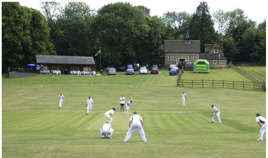
Luddesdowne Cricket Club hosted Kemsing on Saturday in their Kent Village League match

Meanwhile, James Walkling, one of the cleanest hitters around, went into overdrive, crashing 80 incredible runs from 33 balls, including 8 sixes and 6