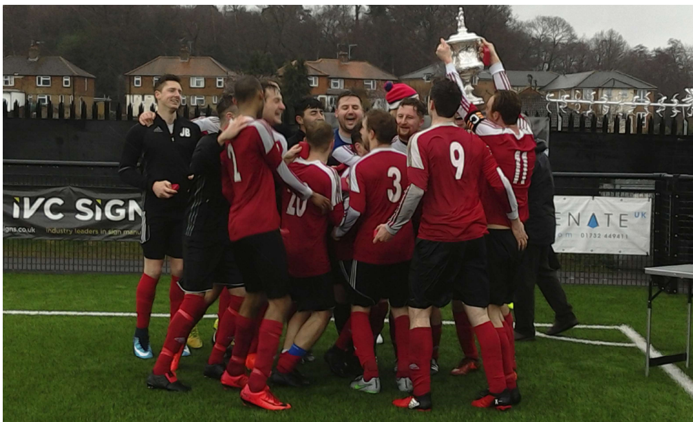
A somewhat sodden Ightham FC carry on their celebrations after beating Malgo FC 3-2 in the final