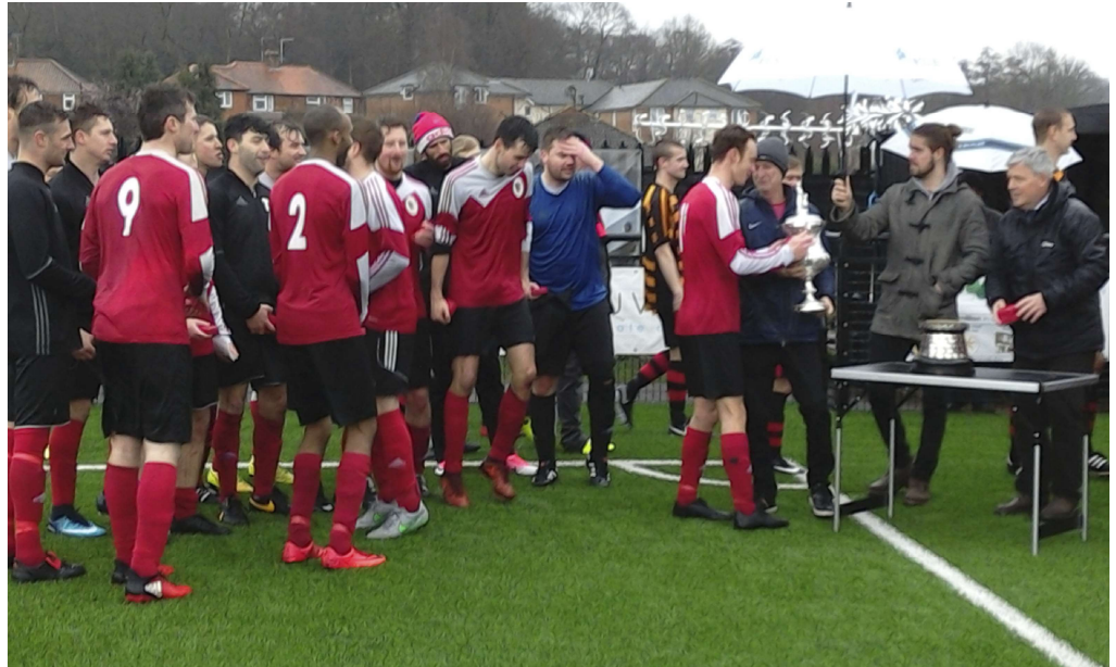
Ightham FC are presented with the prestigious Sevenoaks Senior Charity Cup

Maidstone Association of Local Government Officers (Malgo) were formed in 1921 and played all their early football in the Maidstone